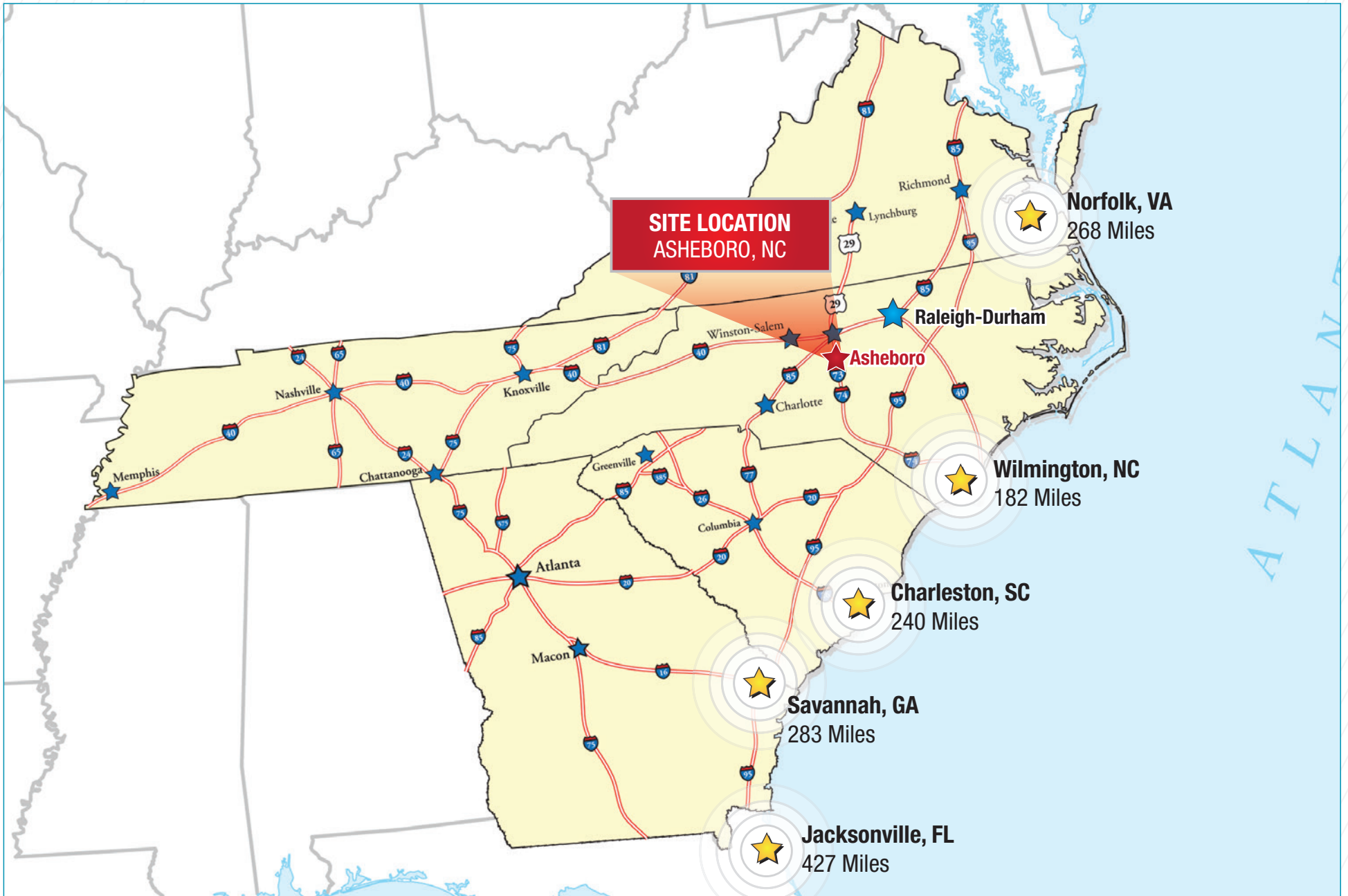
Port Proximity Map

I-74 / I-73 / US 220 & NEW HOPE CHURCH ROAD