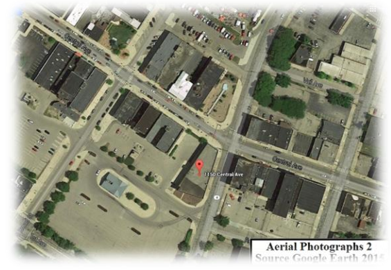
Aerial Photographs 2