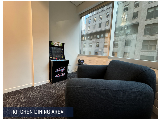
KITCHEN DINING AREA