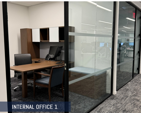
INTERNAL OFFICE 1