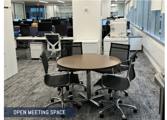
OPEN MEETING SPACE