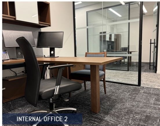
INTERNAL OFFICE 2