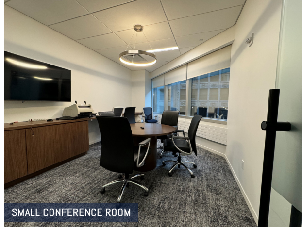
SMALL CONFERENCE ROOM