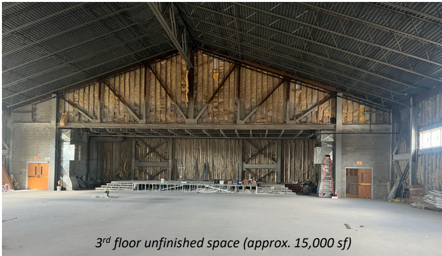
3 rd floor unfinished space (approx. 15,000 sf)