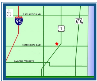
ParkRidge Professional Center Suite 205 1,371 RSF