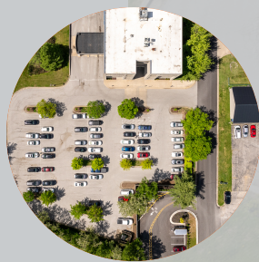
AMPLE PARKING AVAILABLE