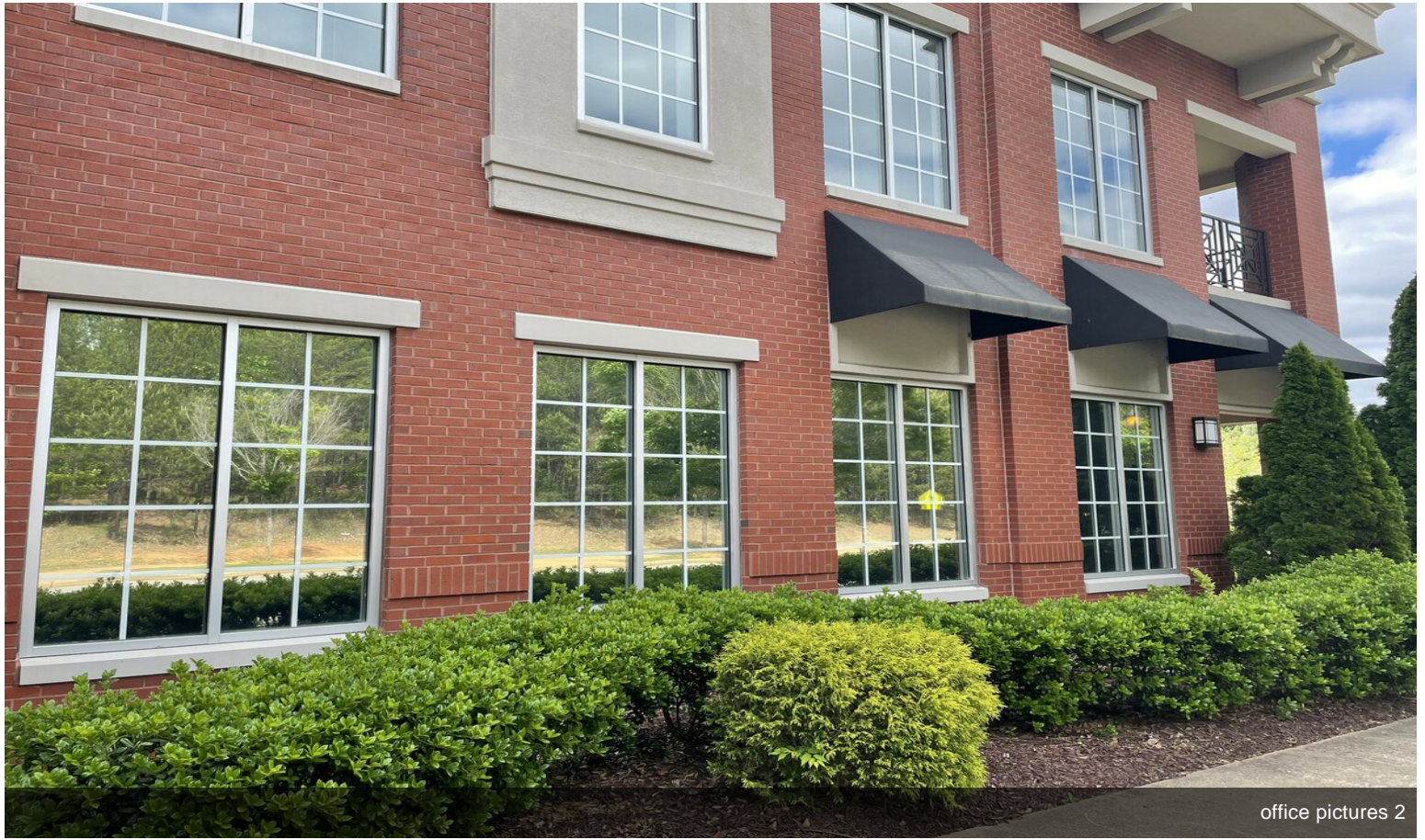
office pictures 2