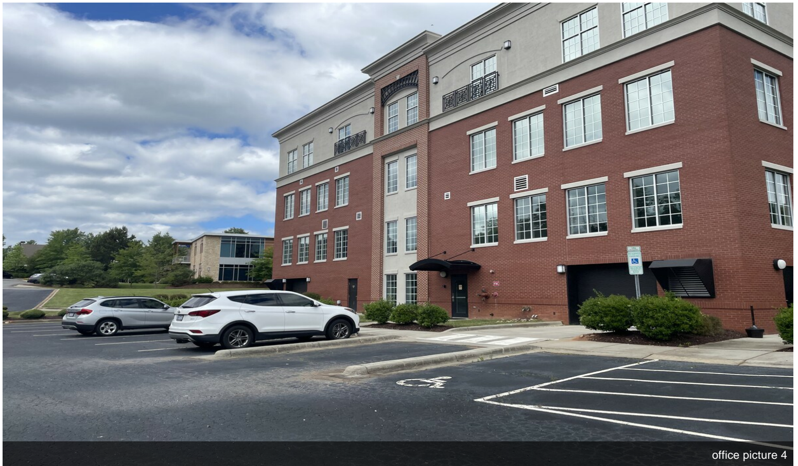
office picture 4