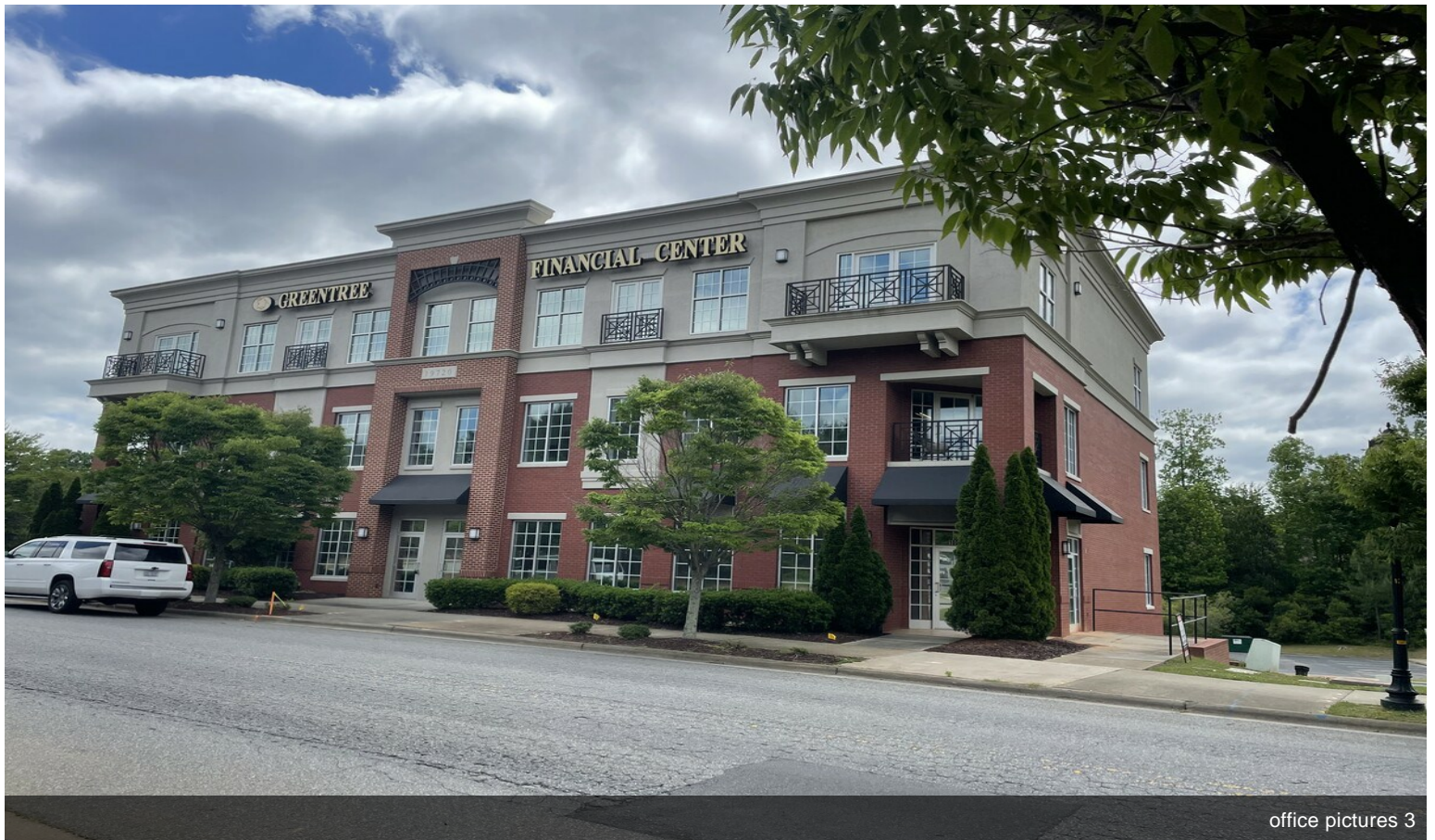
office pictures 3