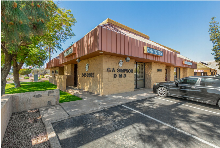
Visibility from High traffic street