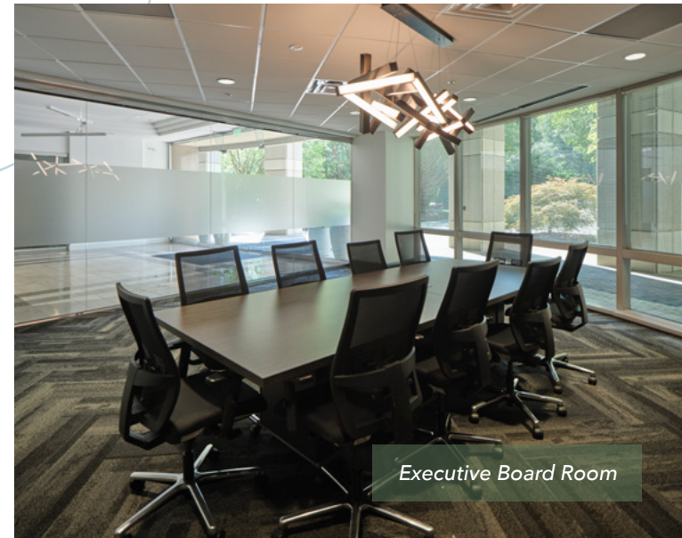
Executive Board Room