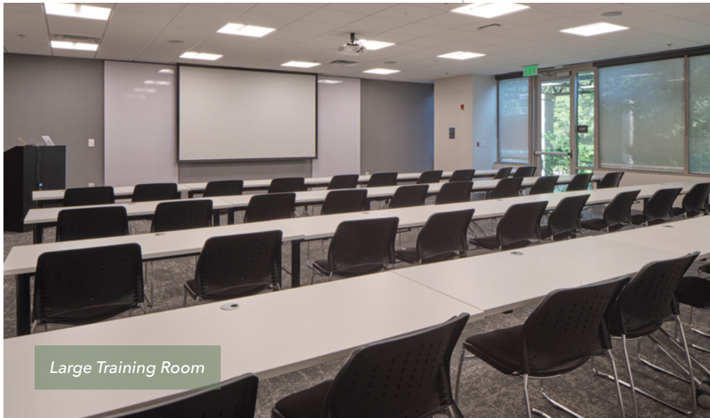
Large Training Room

Large Training Room – Expandable into the lounge to allow for “Town Hall” type events for +100 attendees