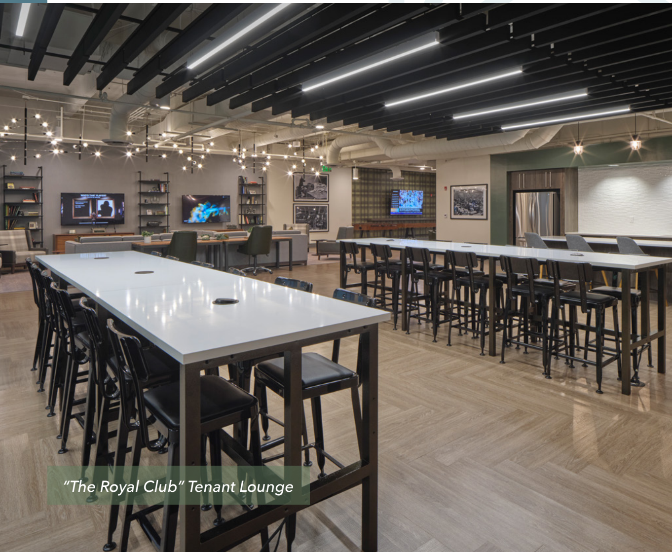
"The Royal Club" Tenant Lounge