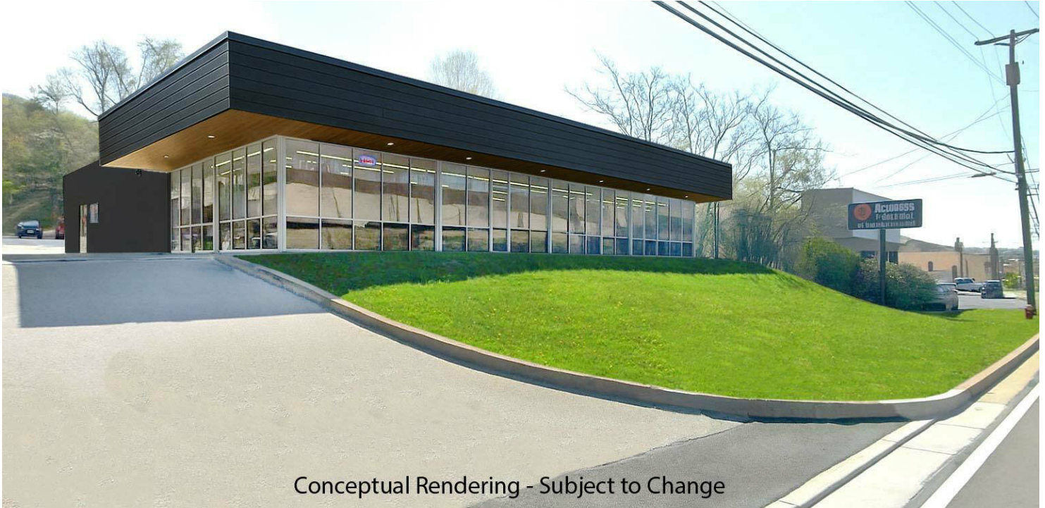
Conceptual Rendering - Subject to Change