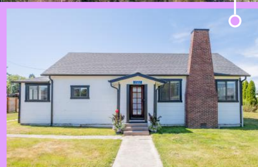
5502 Chuckanut Dr.