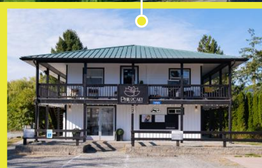
14965 W. Bow Hill Rd.

Bow Kitchen Hub - Restaurant $5,000 Monthly Rent Coffee Stand $1,000 Monthly Rent Possible Total Rent Increases to $6,800 w/ Finished 2nd Floor Construction Parcel #P48583