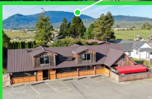
14969 W. Bow Hill Rd.