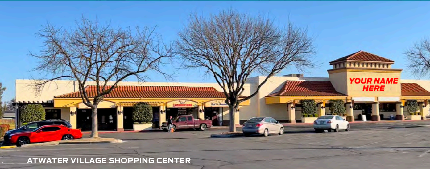
ATWATER VILLAGE SHOPPING CENTER