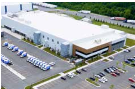
The Kroger Co. — Romulus, MI