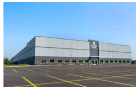
Game One — Swanton, OH