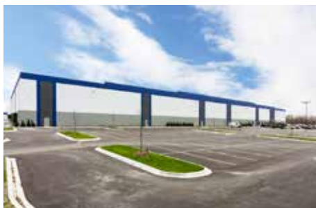
Penske Logistics — Romulus, MI