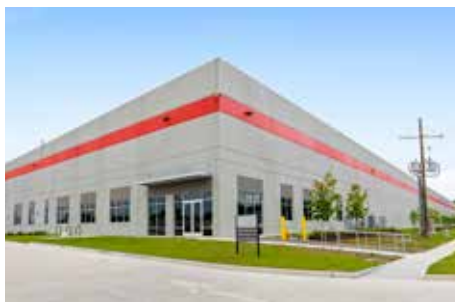
Frito-Lay — Baton Rouge, LA