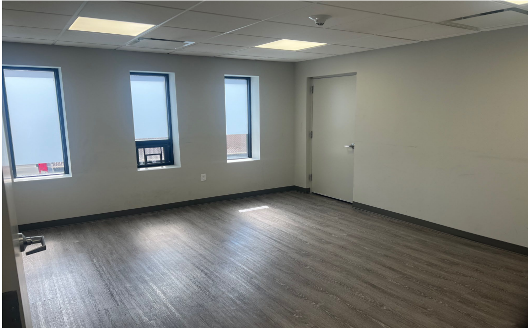
MAIN FLOOR OFFICE