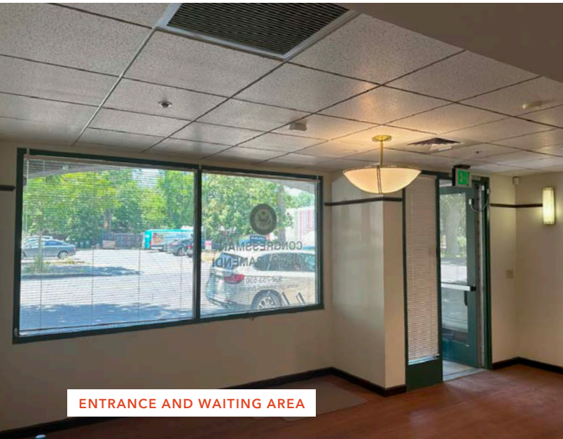
ENTRANCE AND WAITING AREA