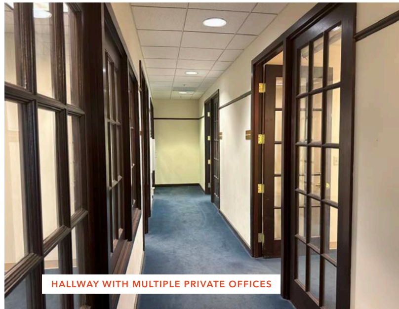
HALLWAY WITH MULTIPLE PRIVATE OFFICES