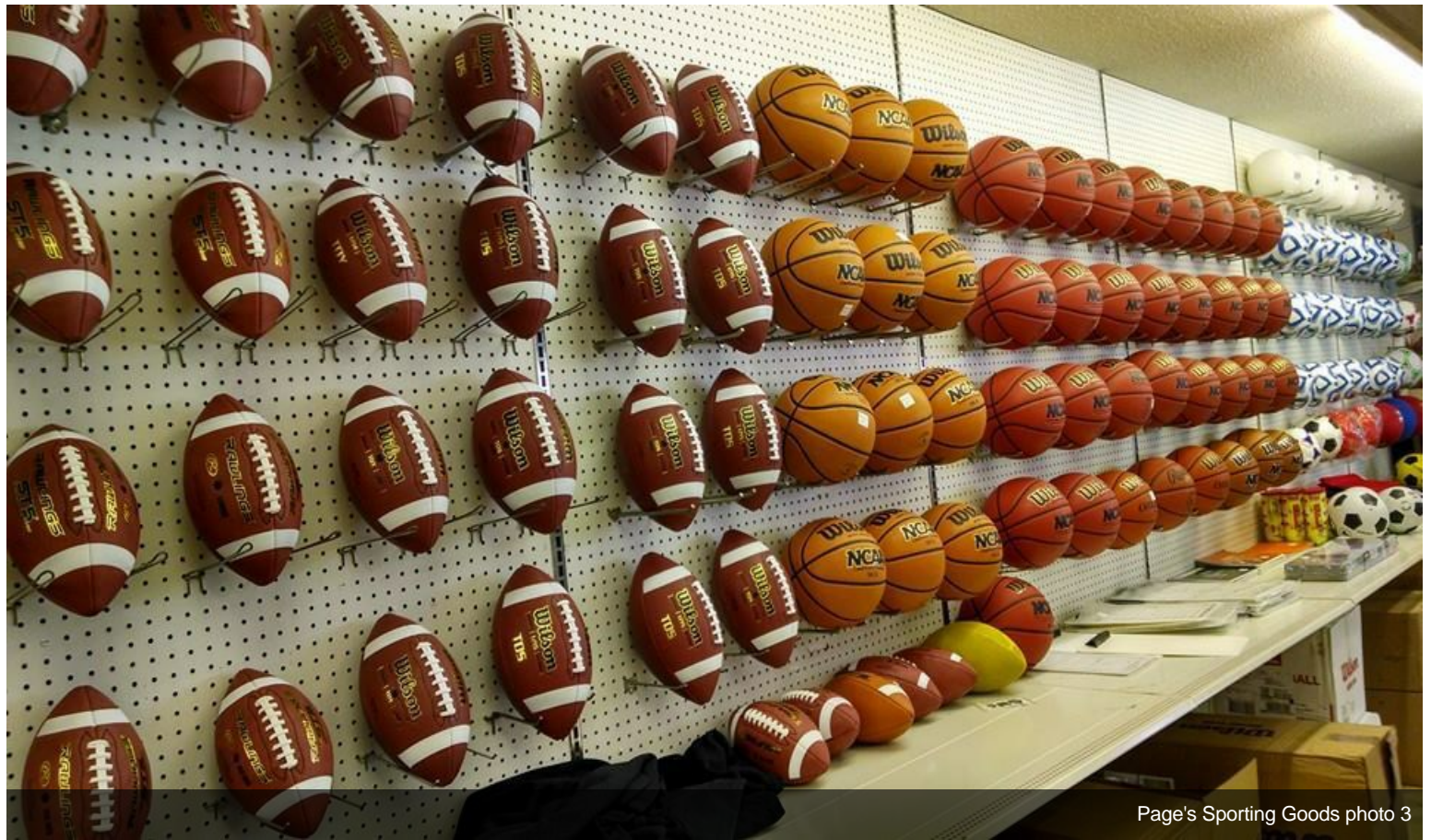
Page's Sporting Goods photo 3