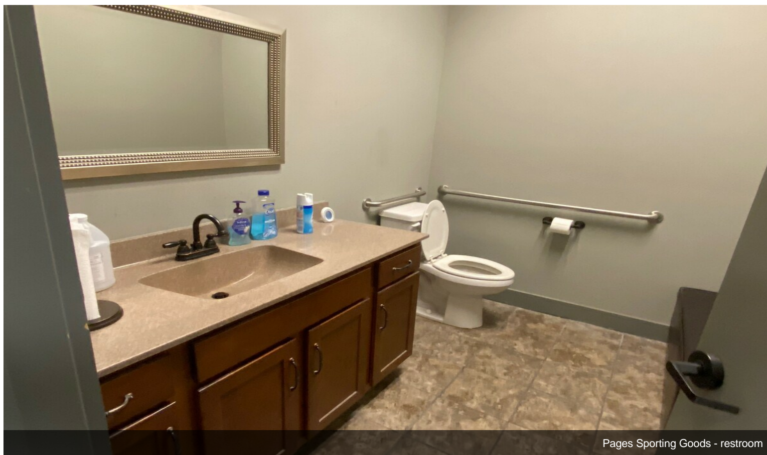
Pages Sporting Goods - restroom