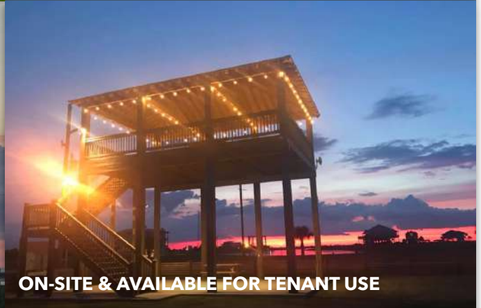
ON-SITE & AVAILABLE FOR TENANT USE