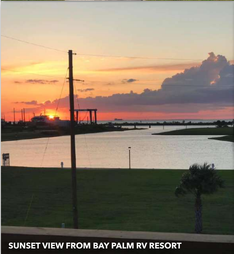
SUNSET VIEW FROM BAY PALM RV RESORT

The Seawall Moody Gardens Bishop's Place Moody Mansion and Museum Kemah Boardwalk Pleasure Pier Galveston Bay Gulf Of Mexico