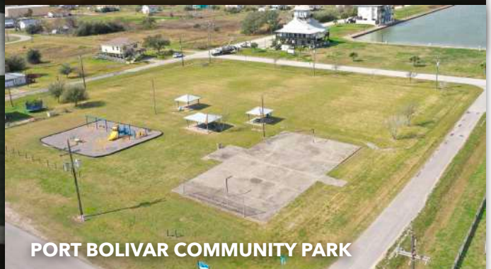
PORT BOLIVAR COMMUNITY PARK