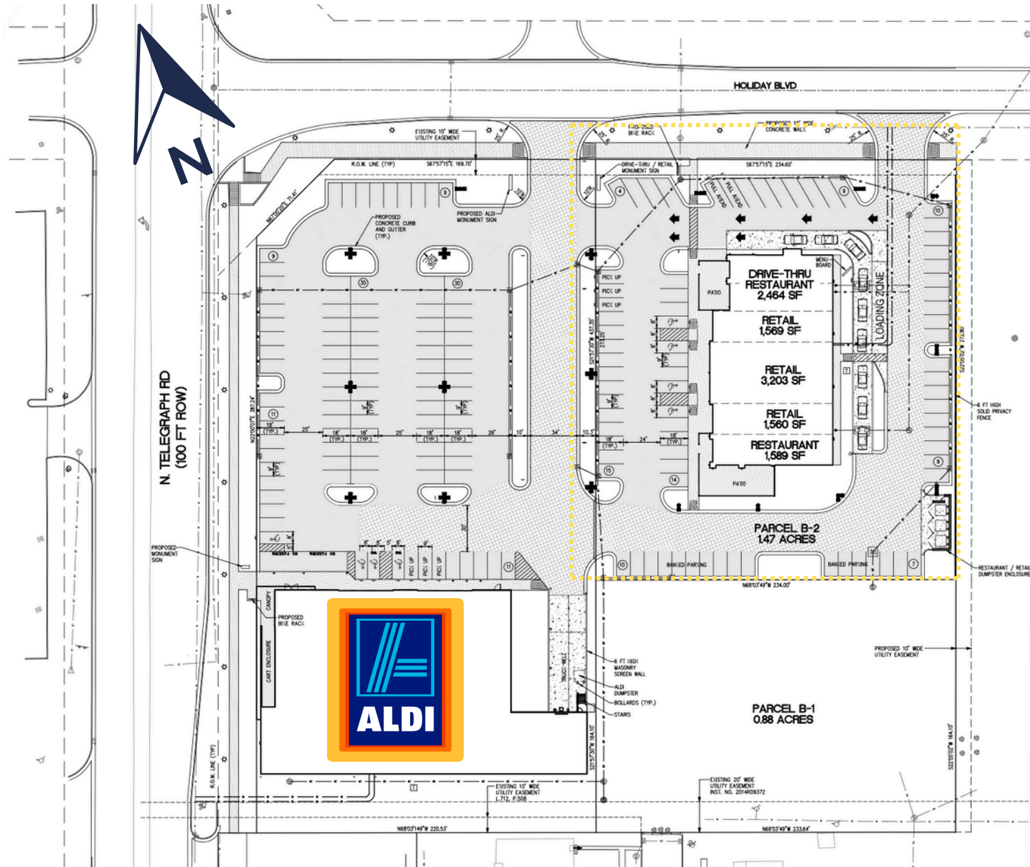
SITE PLAN FOR PARCELS A, B-1 AND B-2