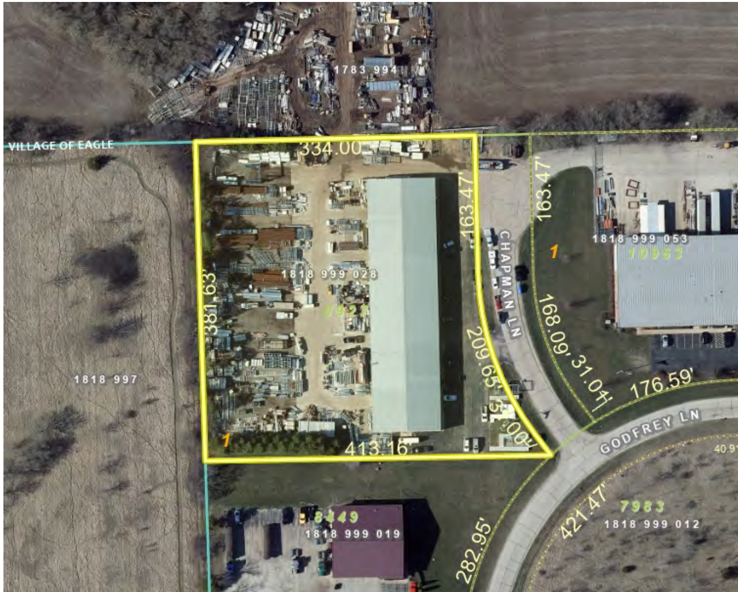
Aerial GIS Map