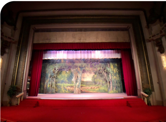
VIEW OF STAGE