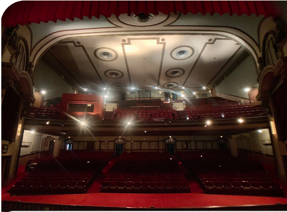
VIEW OF SEATS