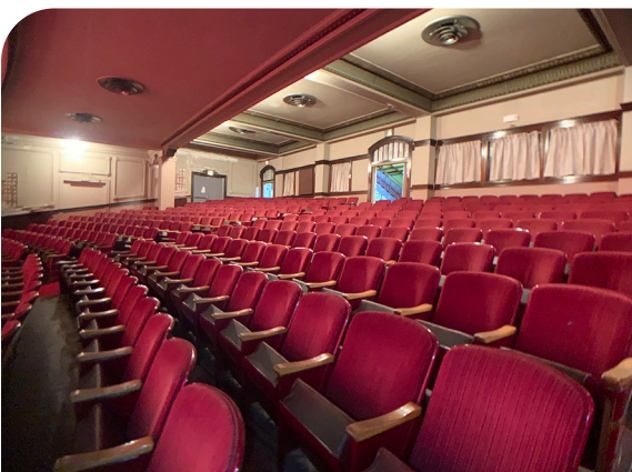
MAIN FLOOR SEATING