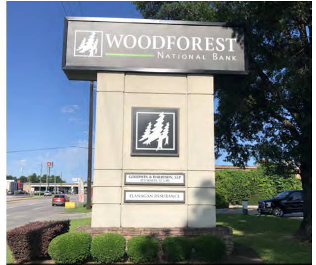
Add text here...

LISA HUGHES JEFF BEARD CCIM O: 281.367.2220 x113 O: 281.367.2220 x102