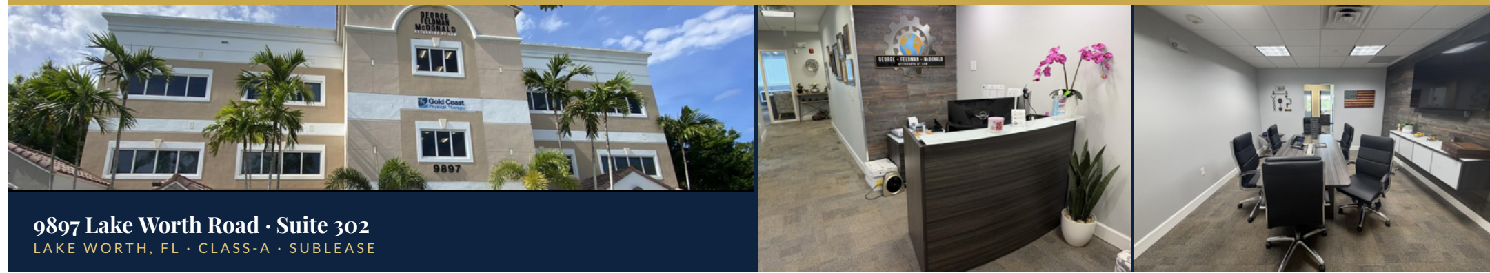
9897 Lake Worth Road · Suite 302 LAKE WORTH, FL · CLASS-A · SUBLEASE