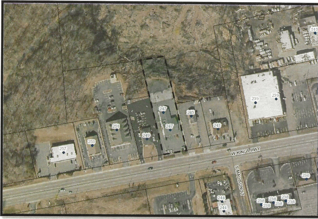
Aerial from Rockingham County Website

The property is located on the north side of W. Kings Highway, just west of S. Van Buren Road, in Eden, North Carolina. According to public record, the site consists of 0.914 acres and is improved with a one-story commercial building having a total of 5,260 square feet of gross building area, per appraisers' measurements. The property is divided into two units and is currently occupied by New Hope Solutions and Wellness Center in suite B, with a lease term ending in September 2021. Suite A had been utilized as Red River Grill, however, the tenant recently abandoned the lease prior to the expiration set for 10/31/2025. The current owners plan to list the property for sale.