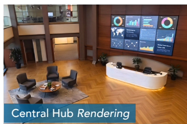
Central Hub Rendering