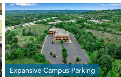
Expansive Campus Parking