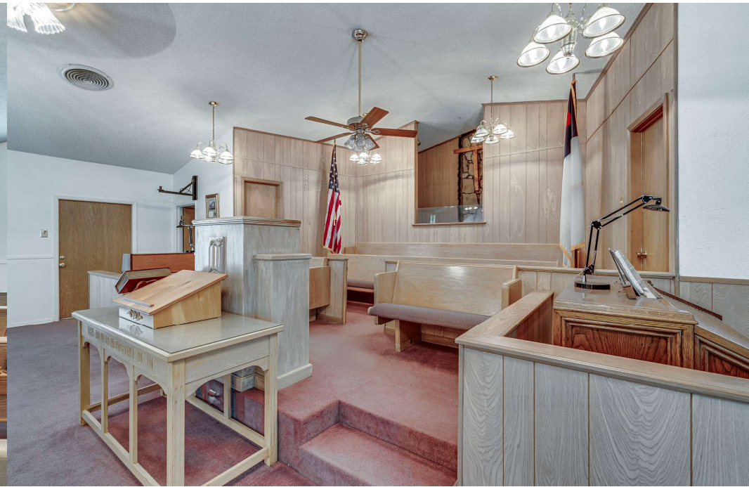
Sanctuary and Pulpit