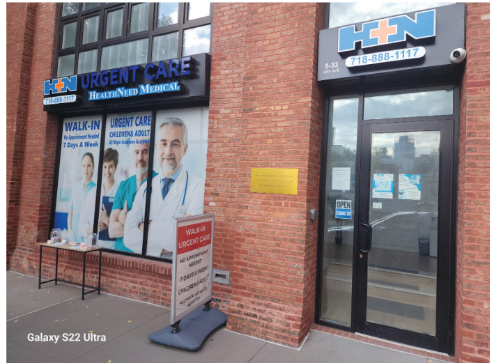
Galaxy S22 Ultra