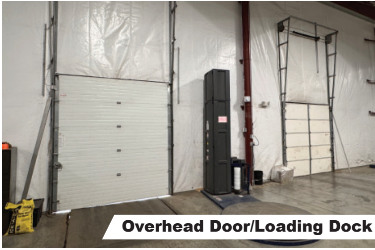
Overhead Door/Loading Dock