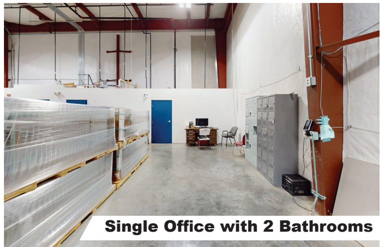
Single Office with 2 Bathrooms