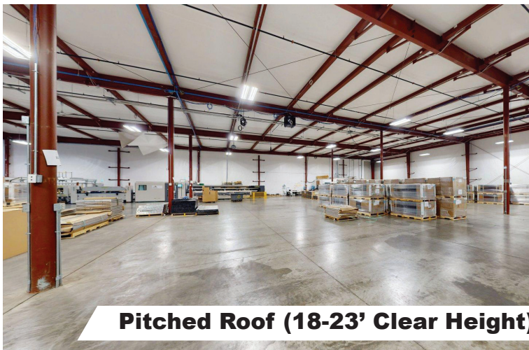
Pitched Roof (18-23' Clear Height)