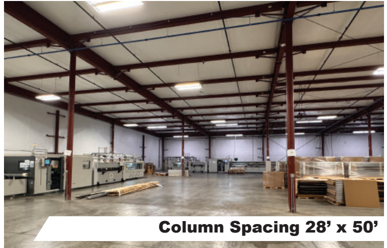
Column Spacing 28' x 50'