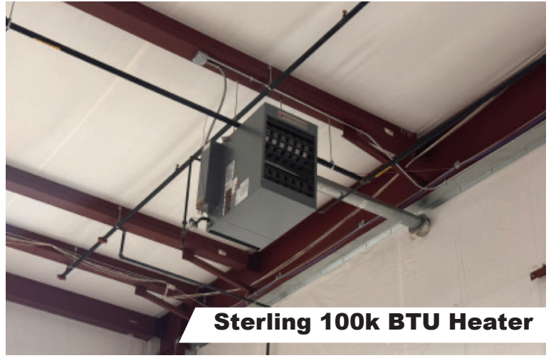
Sterling 100k BTU Heater