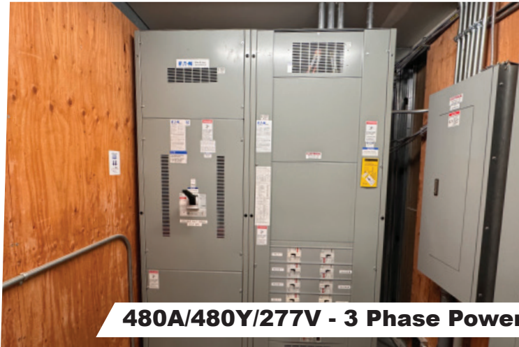
480A/480Y/277V - 3 Phase Power