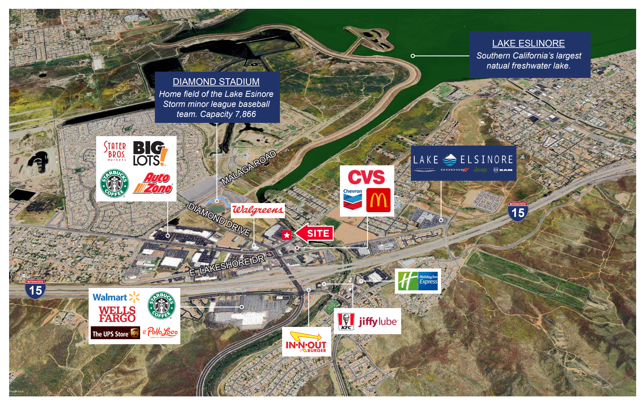
2495 E. Lakeshore Drive | Lake Elsinore, CA