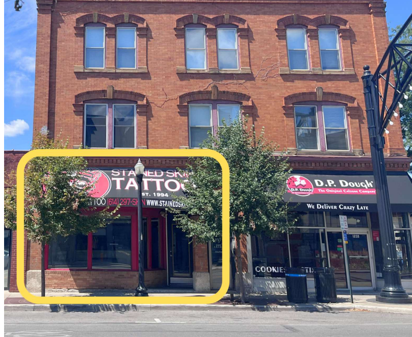
Adjacent, 1,600 SF retail also available to lease @ $20.00 psf Net