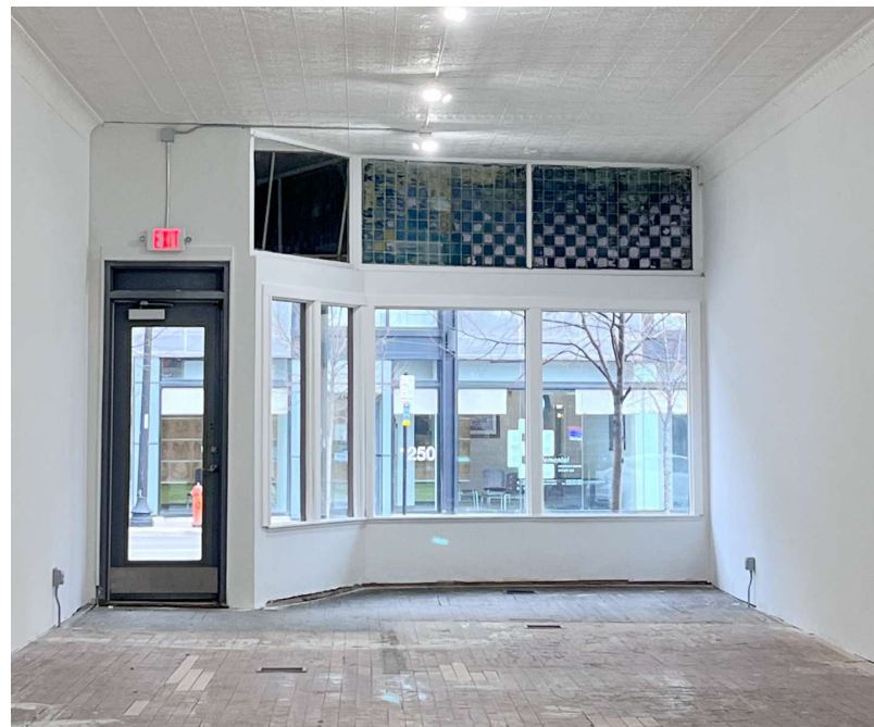
Attractive retail space with great street visibility