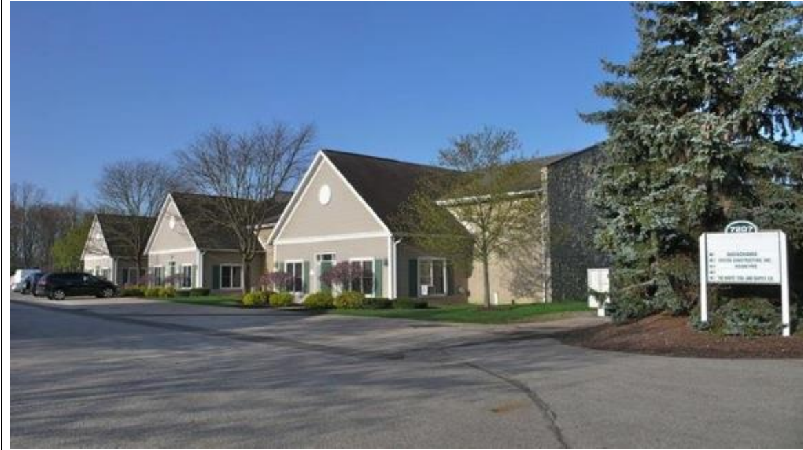
7207 Chagrin Rd – Front View