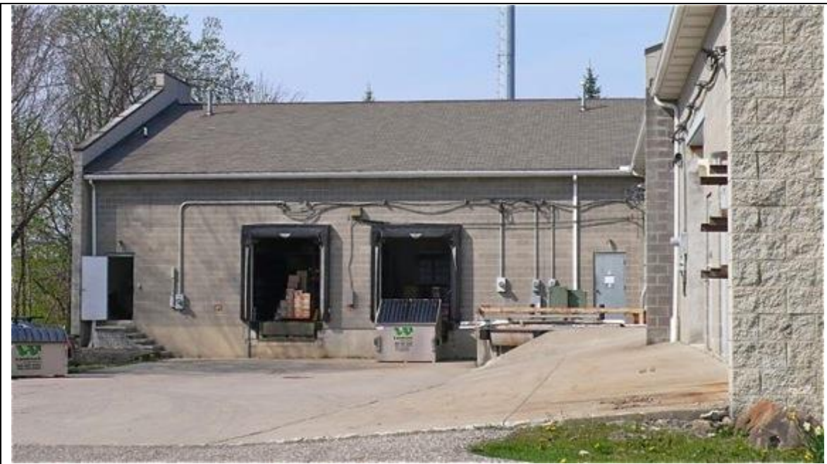
7207 Chagrin Rd - Docks