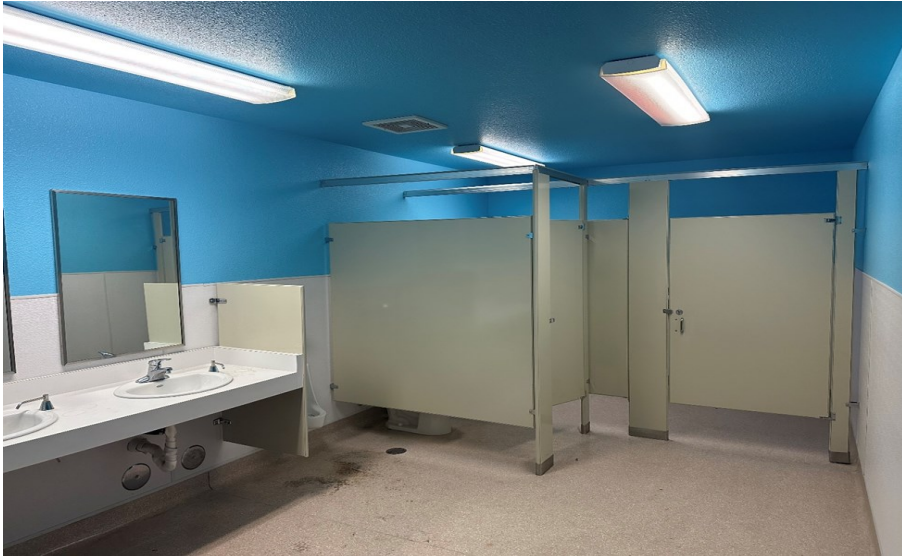
Multi-Stall Men's Restroom