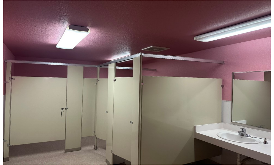
Multi-Stall Women's Restroom