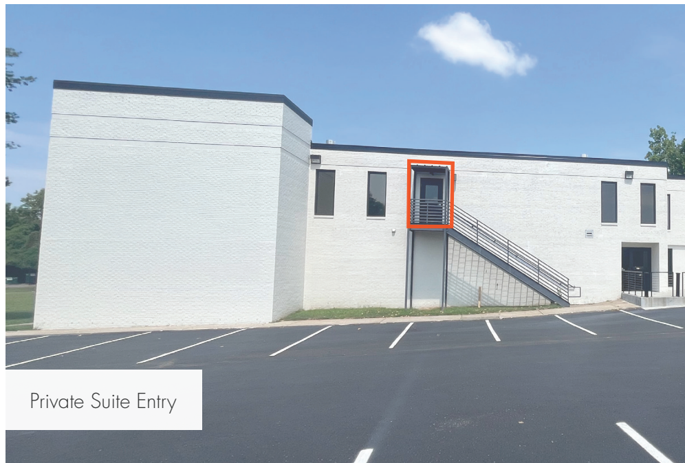
Private Suite Entry