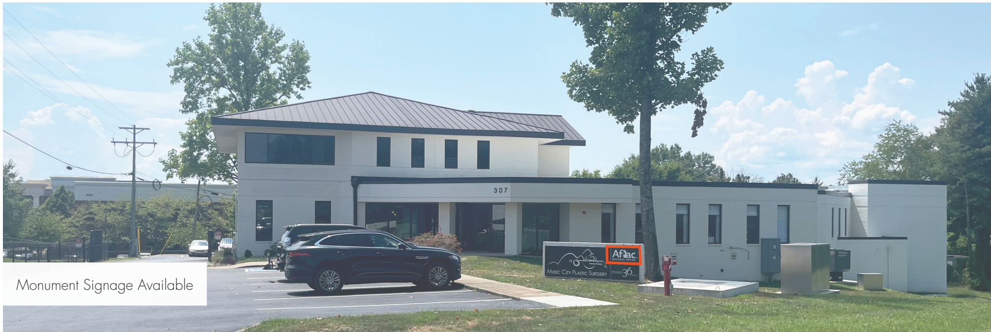
Monument Signage Available