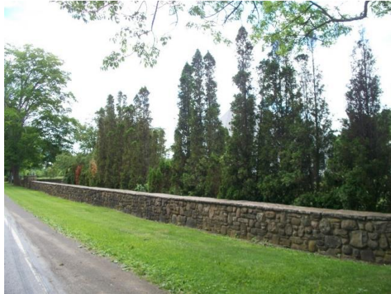
Original Stone Wall