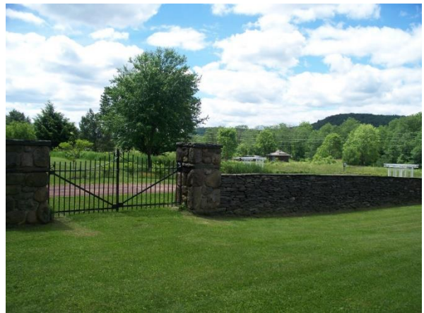
Carriage House lawn, with Spring House and Root Cellar in distance