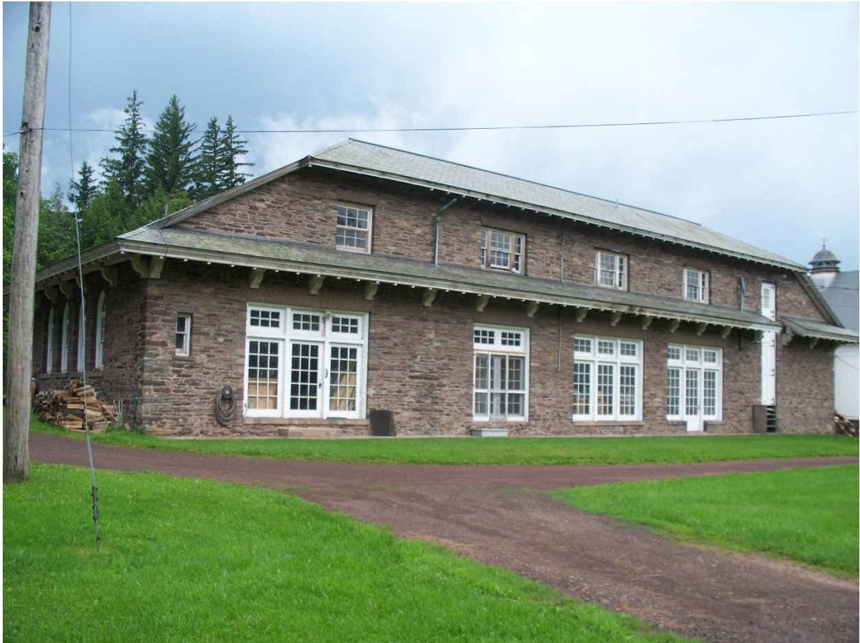
Stone Building, Circa 1885. Slate Roof; Cement Floors

Two-story building, originally built as a private train depot for the original estate owners. Ground floor currently in use as artist studios; second floor is office space. One bathroom. Water, heat and electricity. Two commercial boilers. Steel staircase to upper level. Four sets of French-doors in rear of building for each access; rolling garage door on steel track in front of building. White subway tile on garage walls. Cross-ventilation. Dual-door hatch for getting large objects from ground floor to second floor. Two-story tall narrow door on the right (in photo above) leads to sizeable storage space, which originally functioned as an ice house with a concrete floor.