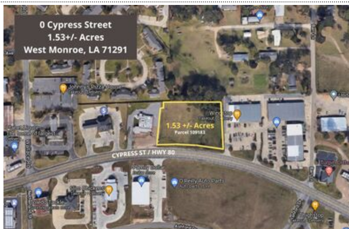
1.53 +/- Acre Commercial Lot

293' Road Frontage All Utilities Available Seller Site-Work Option