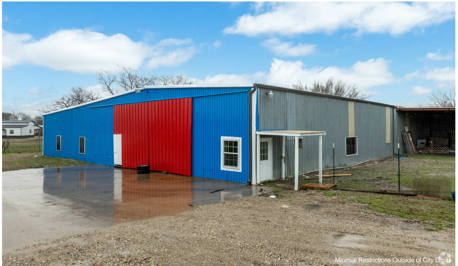
Minimal Restrictions Outside of City Limits