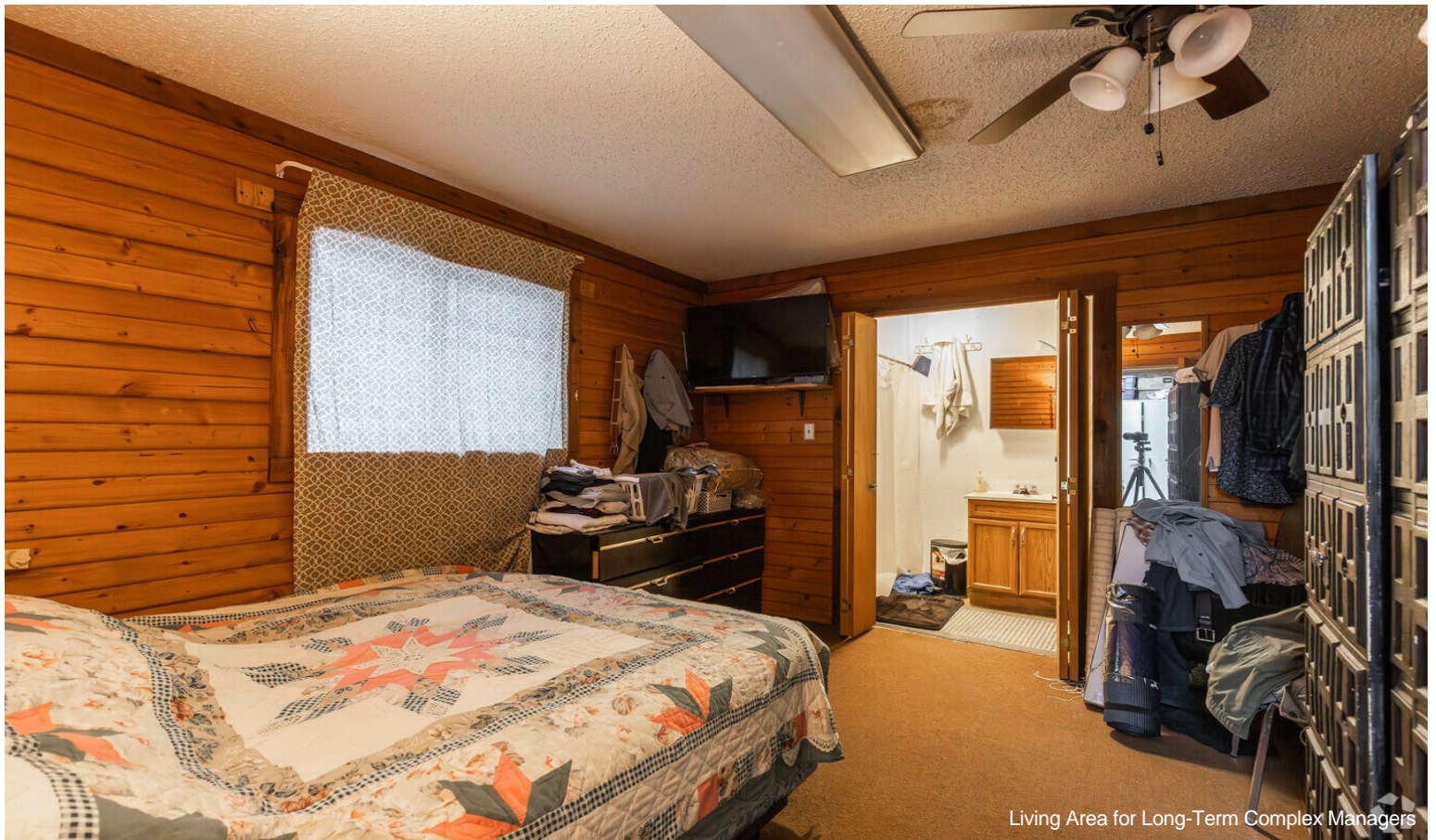
Living Area for Long-Term Complex Managers