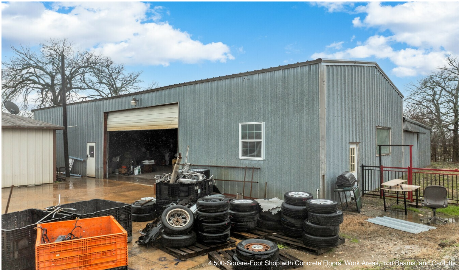
4,500-Square-Foot Shop with Concrete Floors, Work Areas, Iron Beams, and Car Lifts