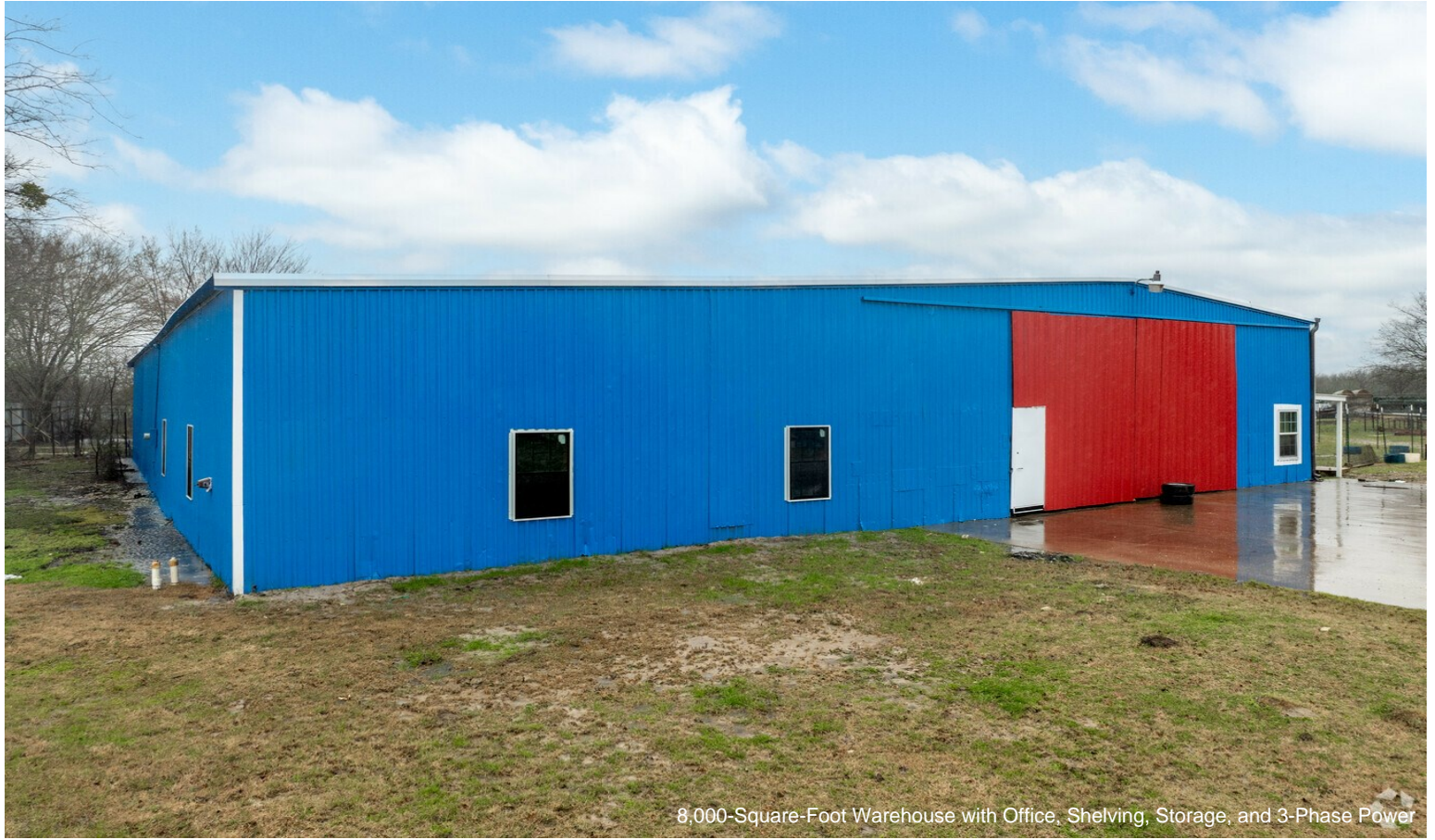
8,000-Square-Foot Warehouse with Office, Shelving, Storage, and 3-Phase Power