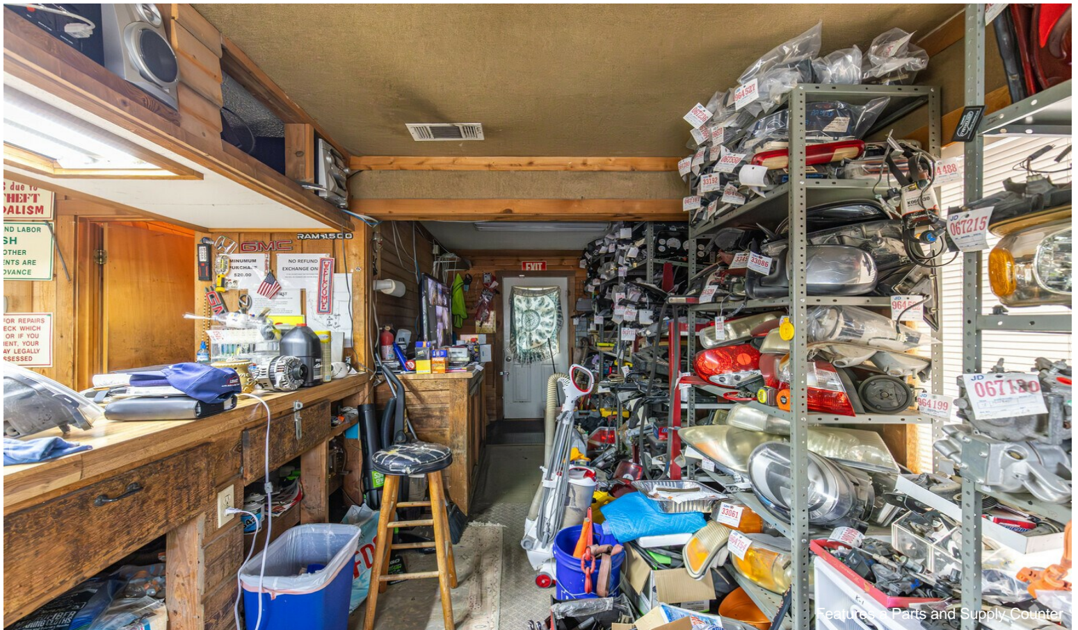
Features Parts and Supply Counter