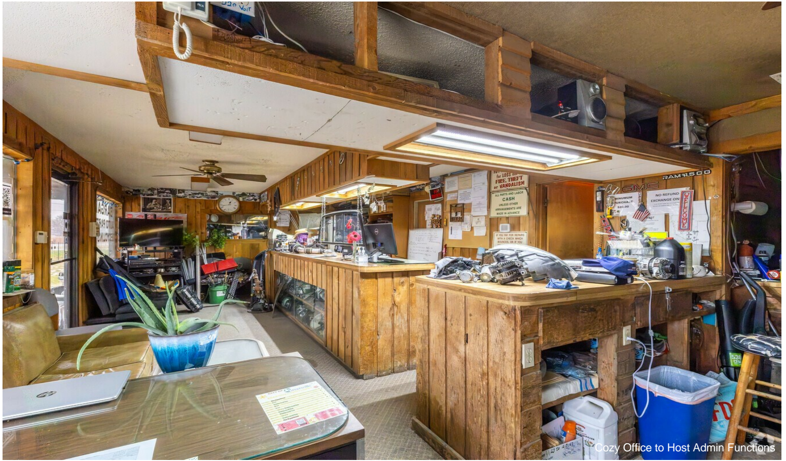
Cozy Office to Host Admin Functions