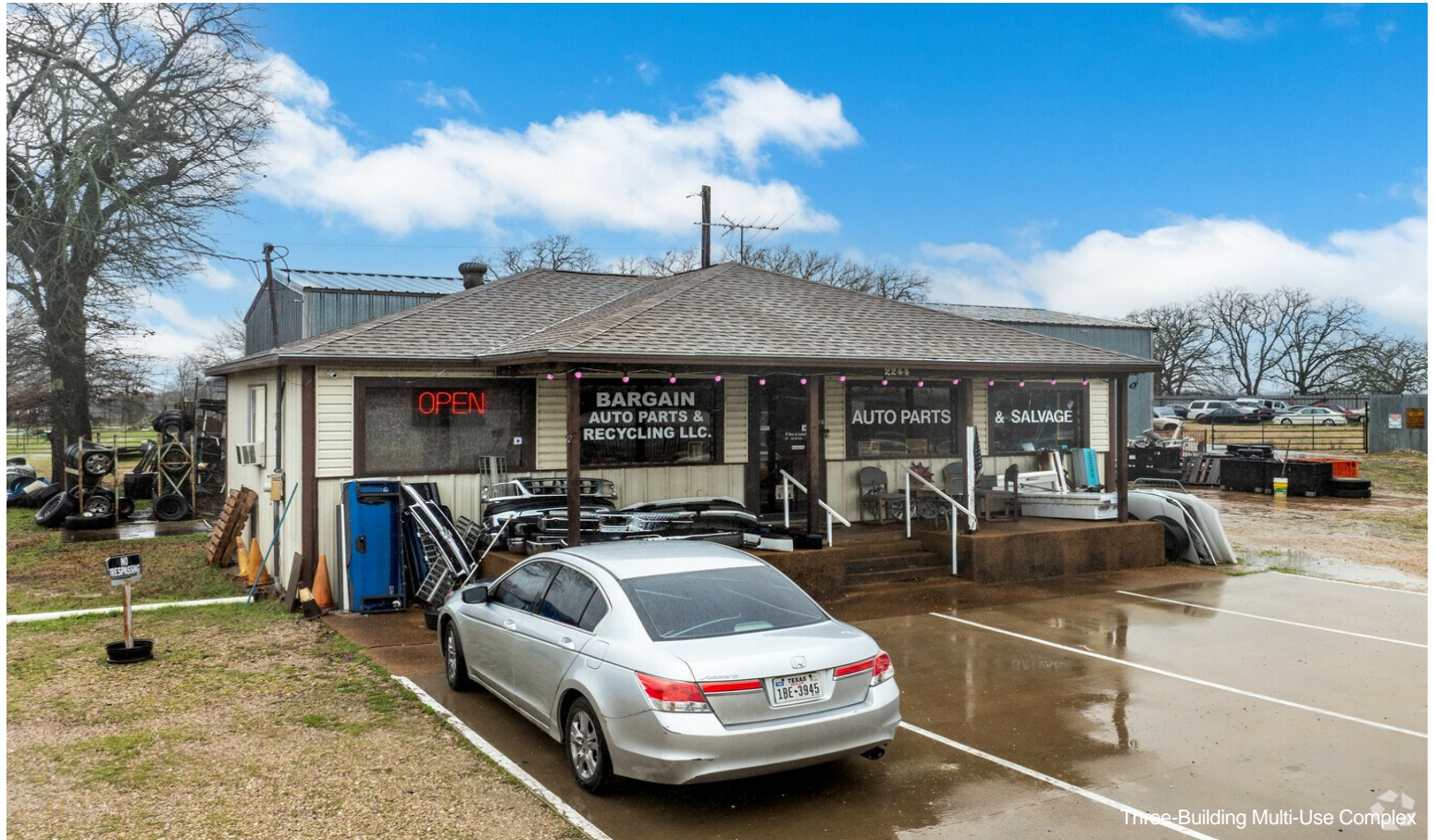
Three-Building Multi-Use Complex