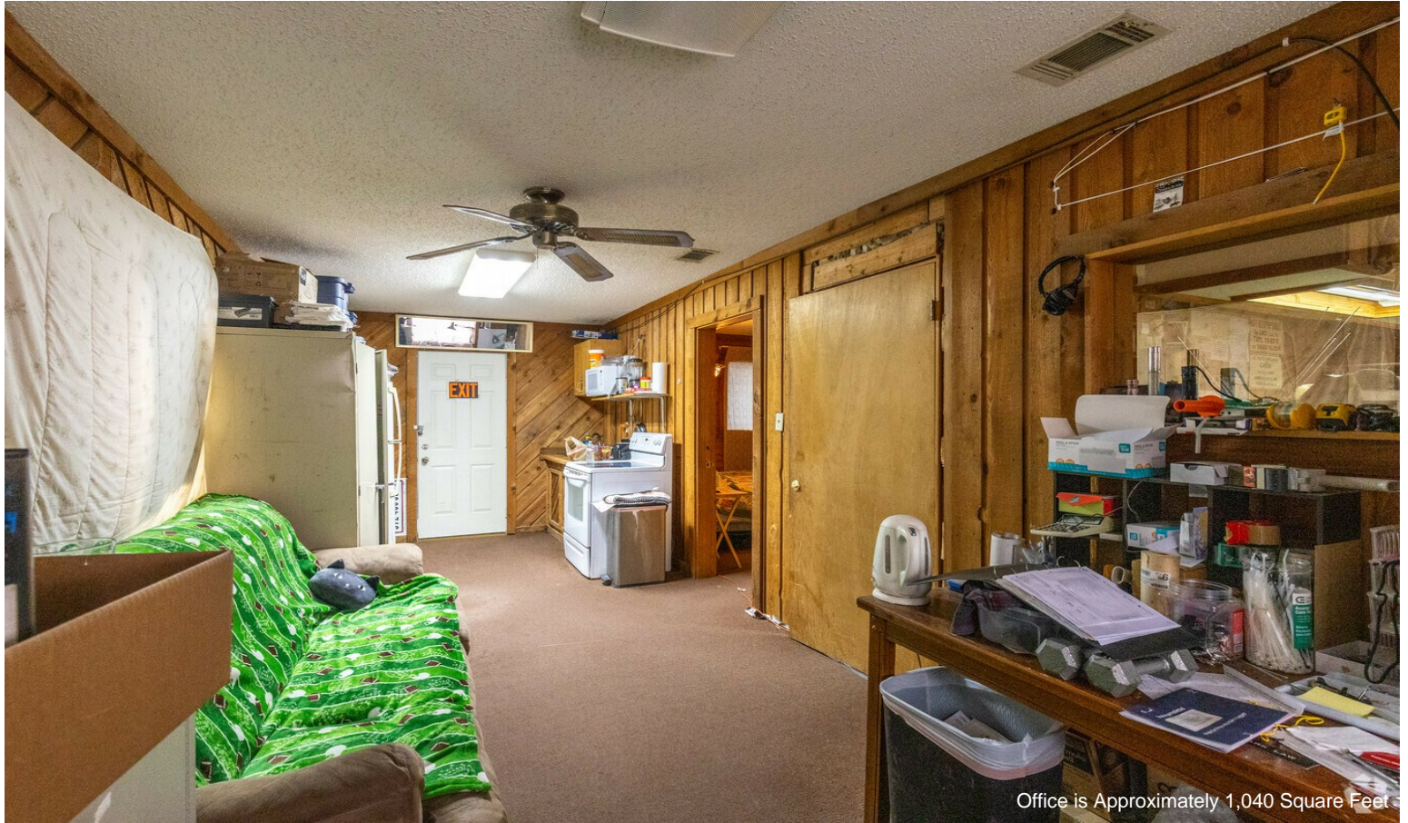
Office is Approximately 1,040 Square Feet