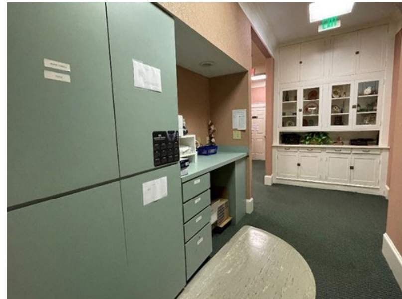
Nursing Station / Filing