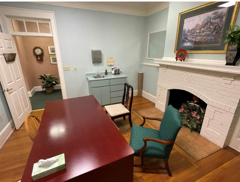
Exam / Office #1