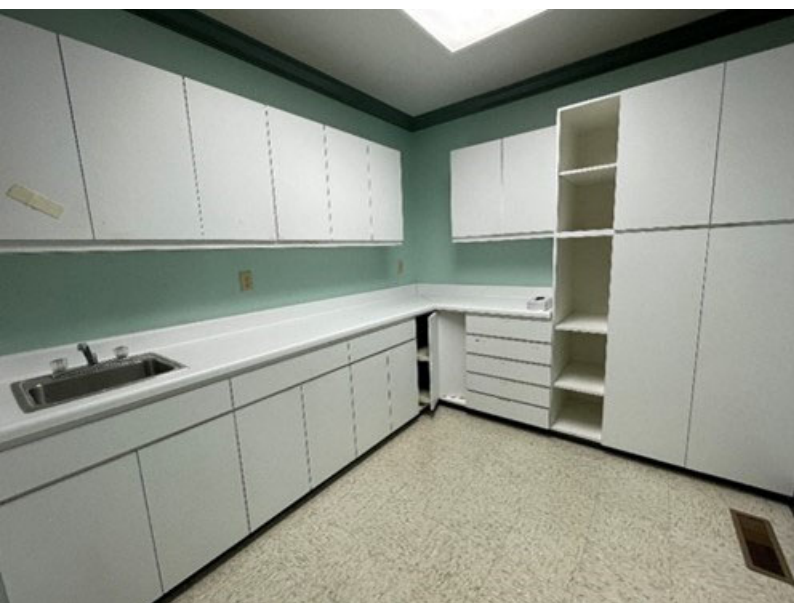
Lab / Supply Room