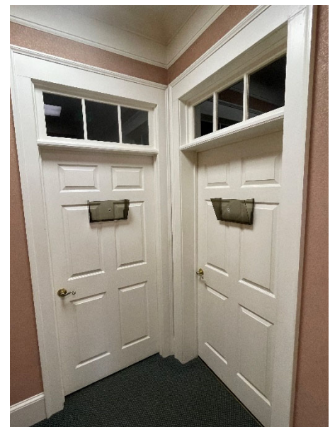
Exam / Office Entry