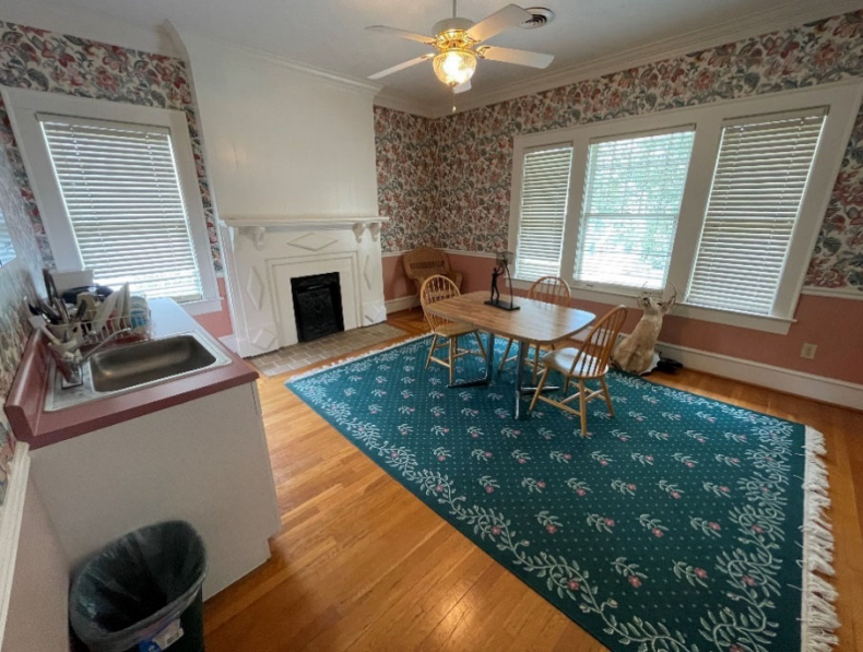
Break & Conference Room