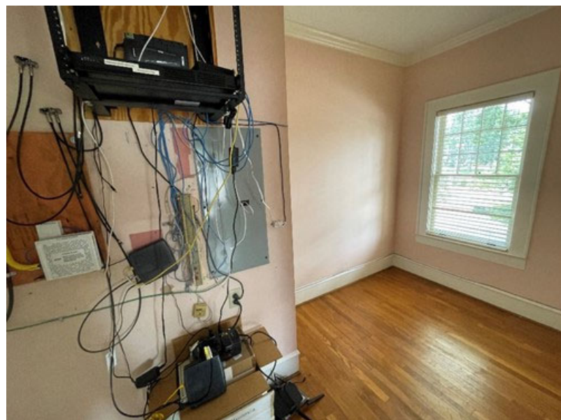
IT / Storage Room