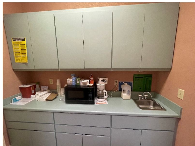
Staff Break Area