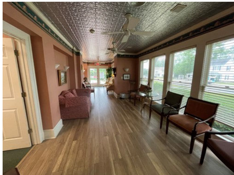
Reception / Waiting Area