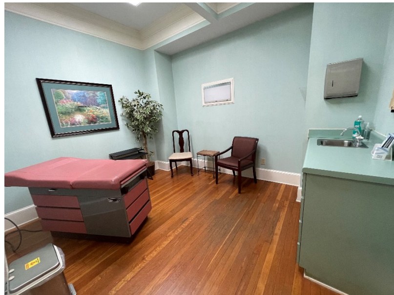
Exam / Office #2