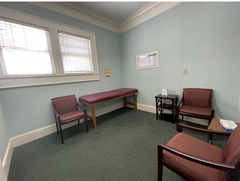
Exam / Office #3