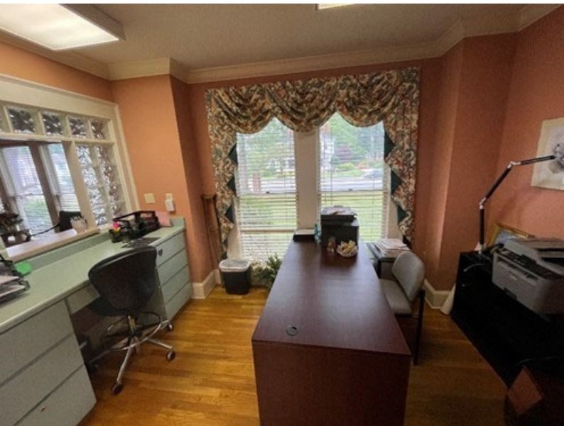
Reception / Business Office