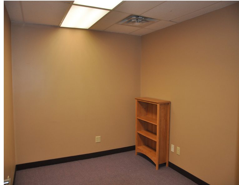
5 Private Offices, Reception Area, No Windows