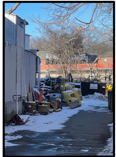
Small backyard outdoor storage area