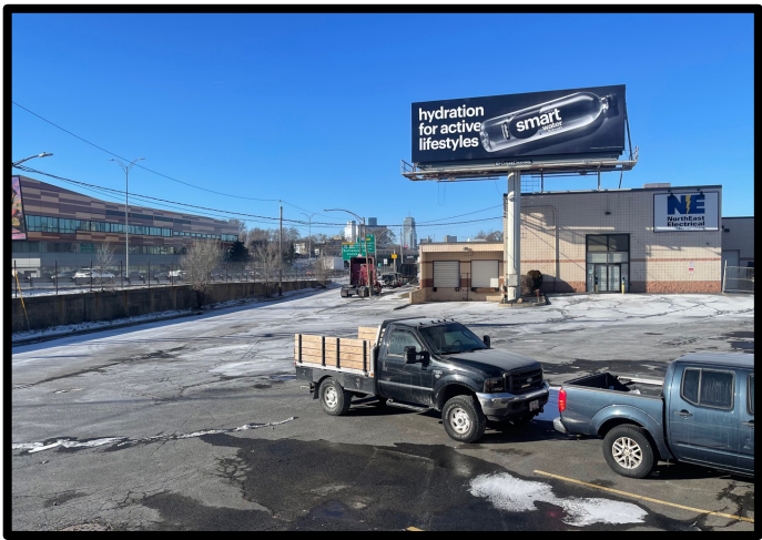
View of Southeast Expressway/Route 93, Carpenters Union headquarters and Back Bay office towers – from atop the front loading platform