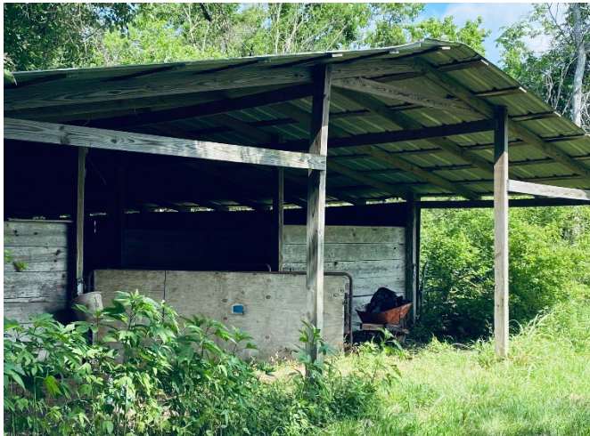
Barn on Property