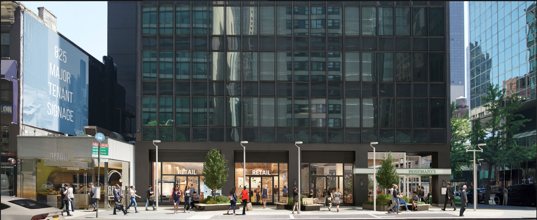
THIRD AVENUE RETAIL