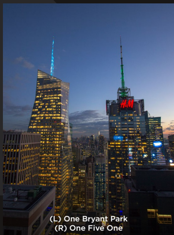
(L) One Bryant Park (R) One Five One

The Durst Organization owns and manages 13 million square feet of Class A office and retail space and over three million square feet of residential rental properties, with 3,400 apartments built and several thousand in the pipeline.