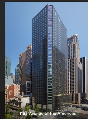
1155 Avenue of the Americas