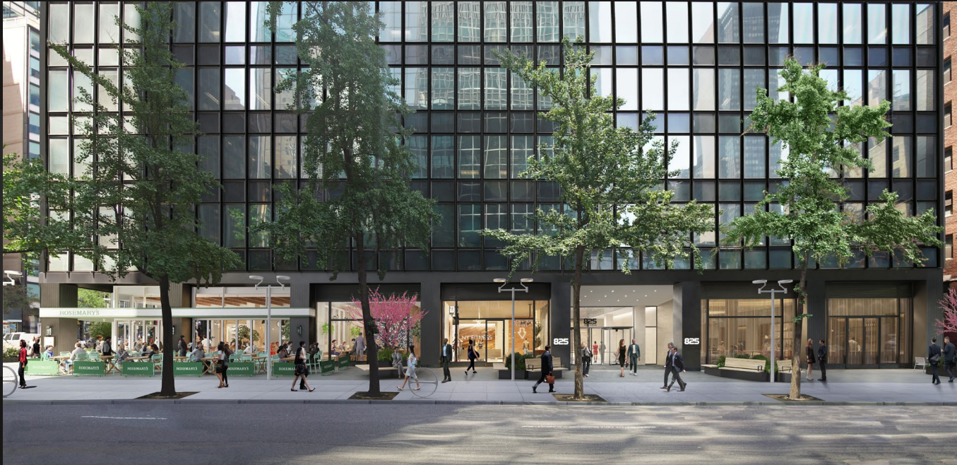
50 TH STREET RETAIL & BUILDING ENTRANCE