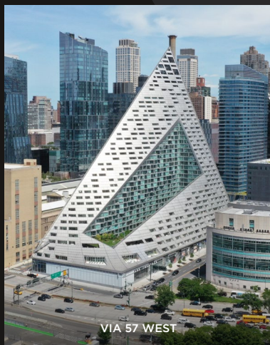
VIA 57 WEST