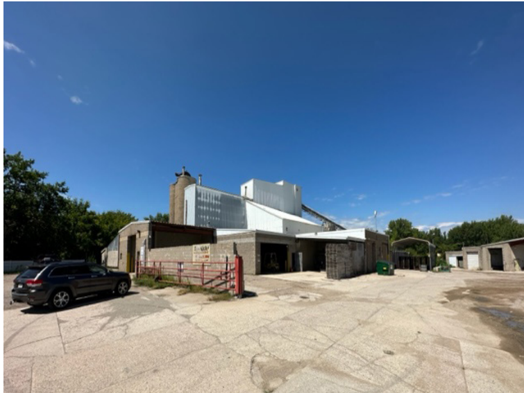
Former Manufacturing Plant Removed by Seller or Available "As-Is".