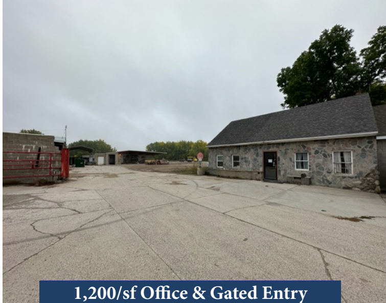
1,200/sf Office & Gated Entry