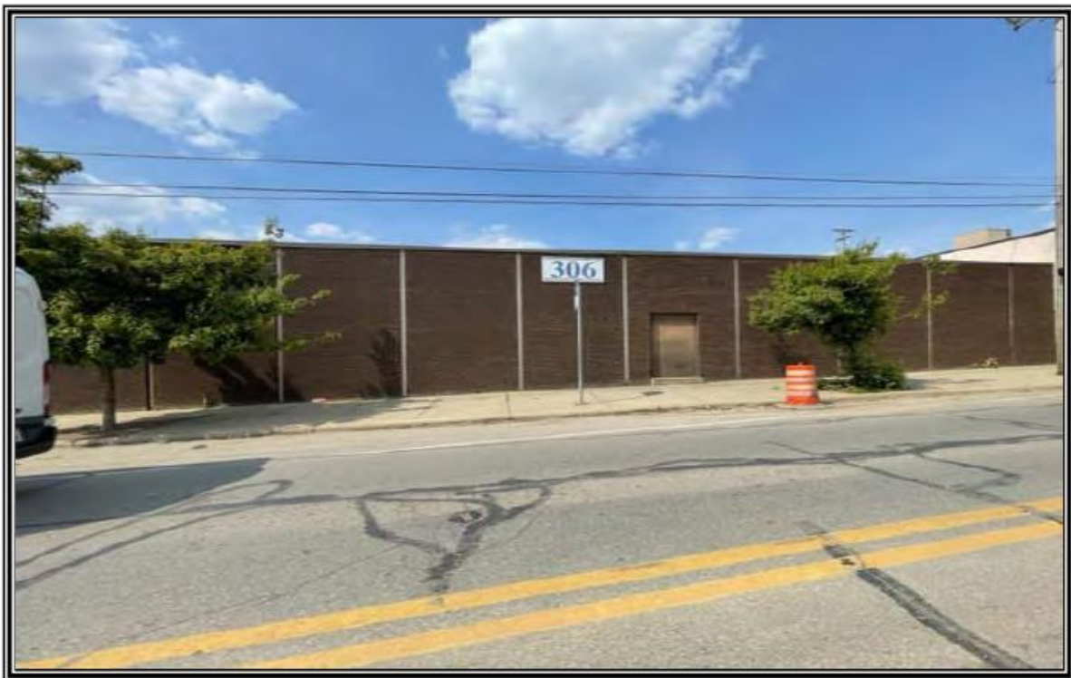
View looking north at subject property from E. Fifth Avenue

Building Area: 20,772 sq. ft. Finished Area: 5,175 sq. ft. (25%) Year Built Built 1928 to 1965 (50 to 87 years old) Construction Type: One-story brick and concrete block Condition: Average