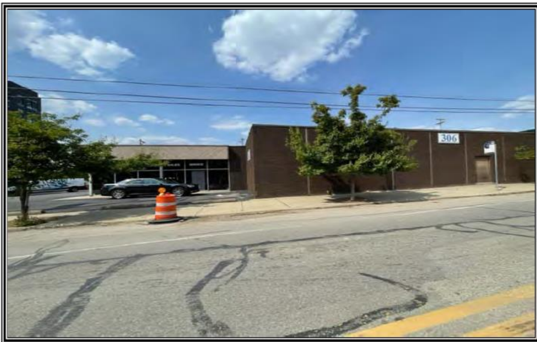
View looking north at subject property from E. Fifth Avenue