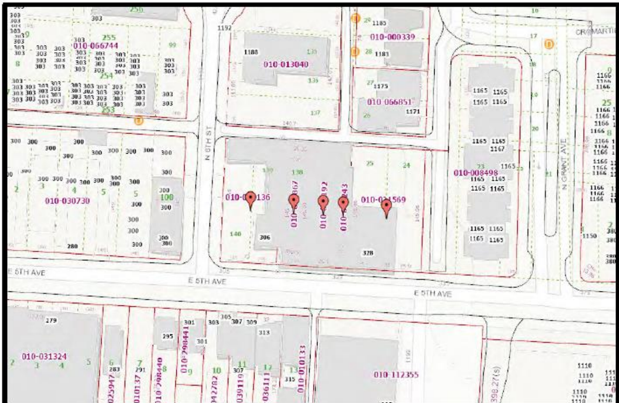
Auditor's Plat Map