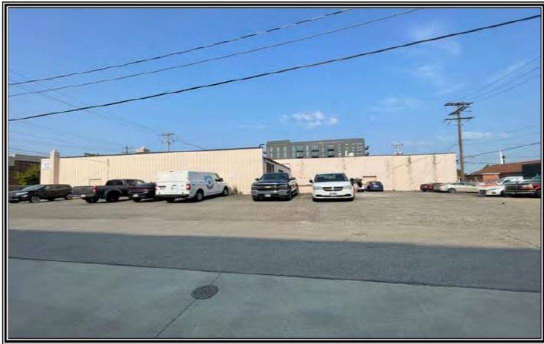
View looking west at subject property from rear alley