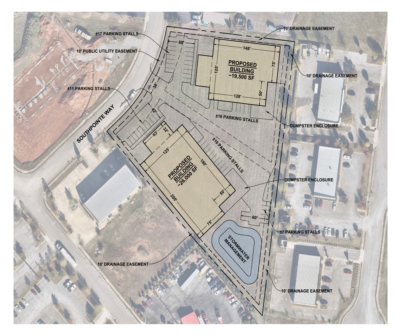
Lot 17 & 18 Southpointe Way, Murfreesboro, TN 37129