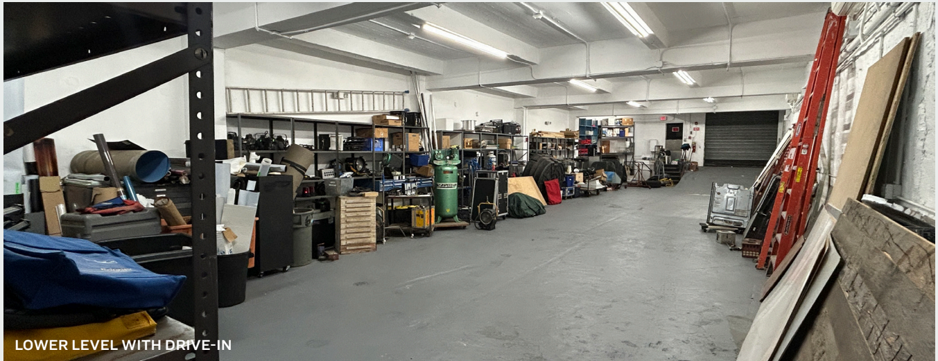
LOWER LEVEL WITH DRIVE-IN