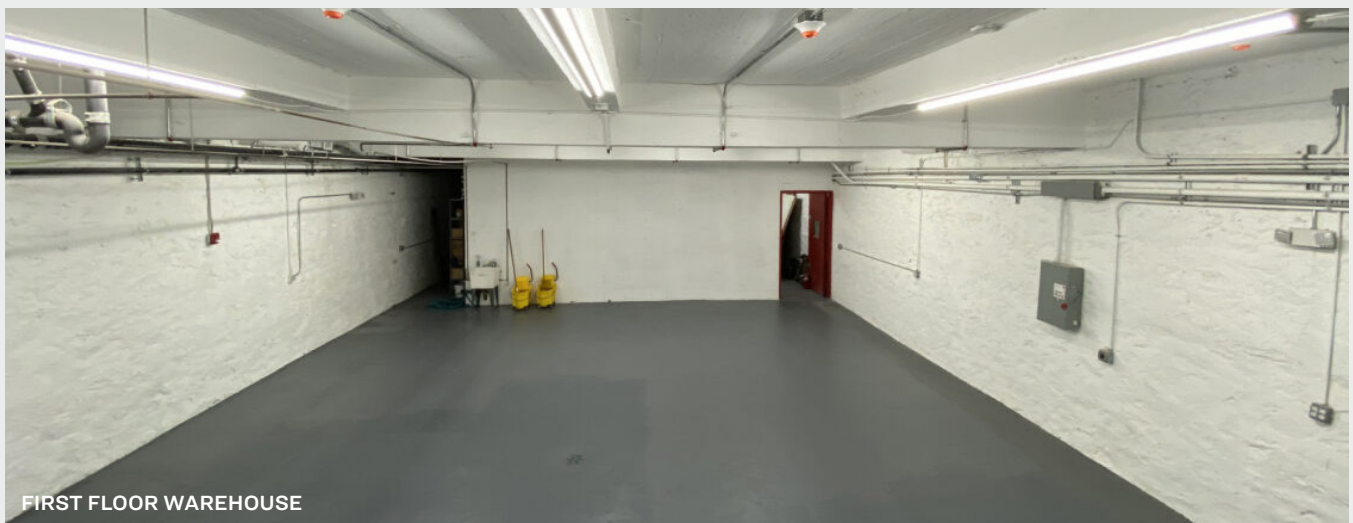
FIRST FLOOR WAREHOUSE