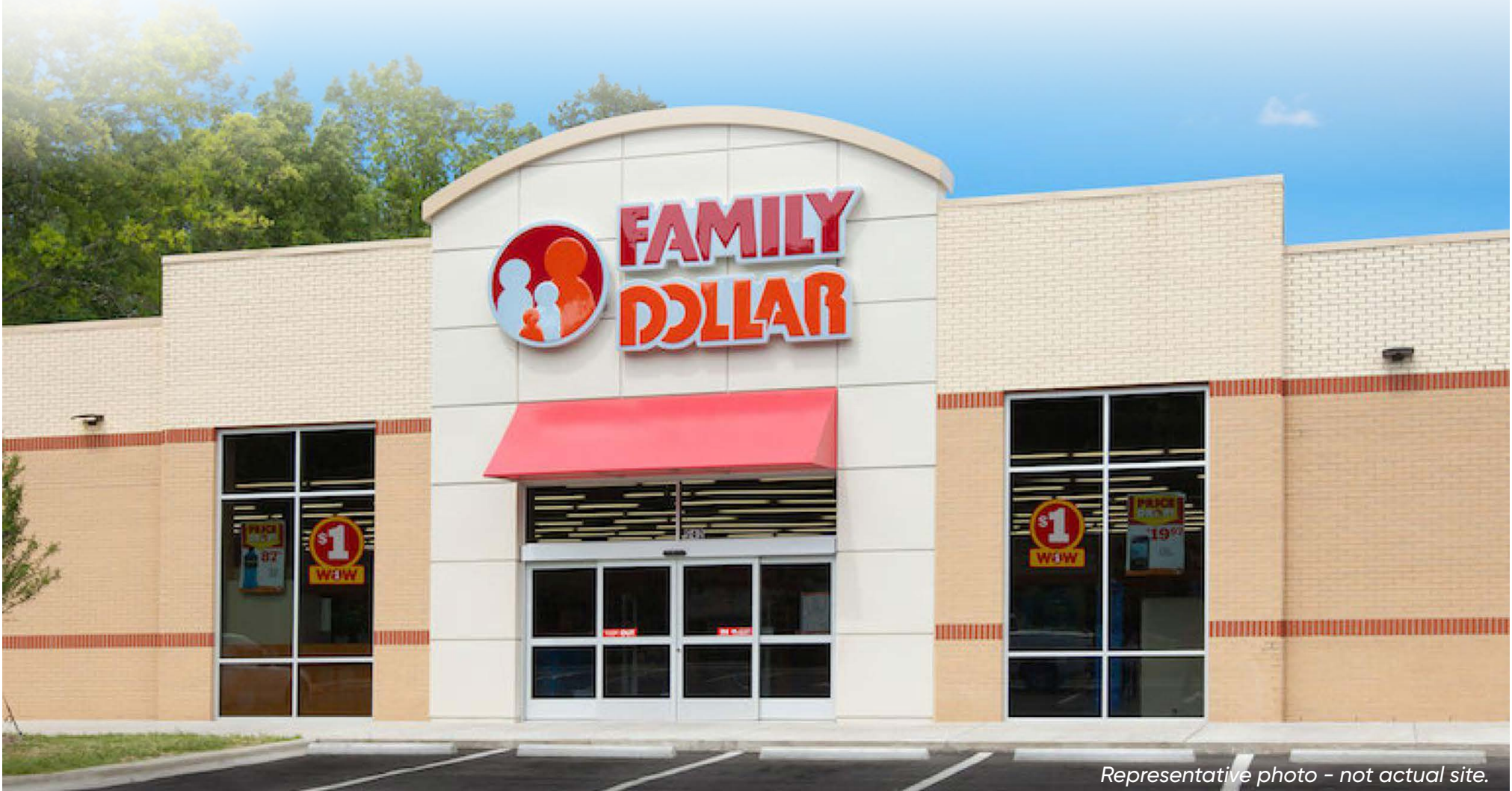
Representative photo - not actual site.

SE CORNER OF HIGHWAY 59 & HOOKS CEMETERY LOOK 6975 U.S. 69 Kountze, TX 77625