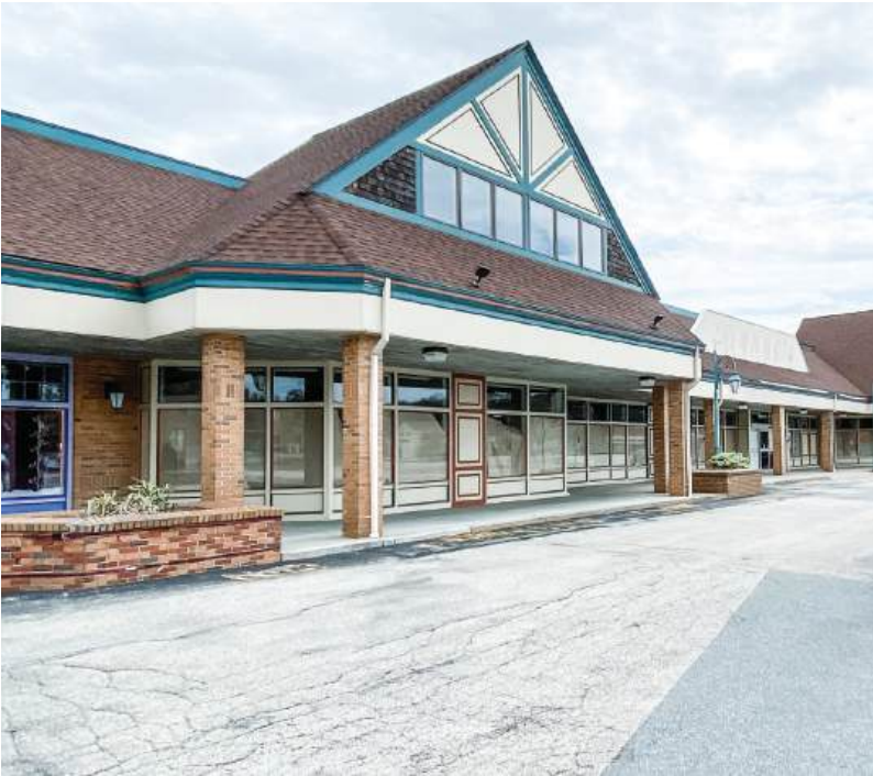
SIGNED TENANT AVAILABLE SPACE