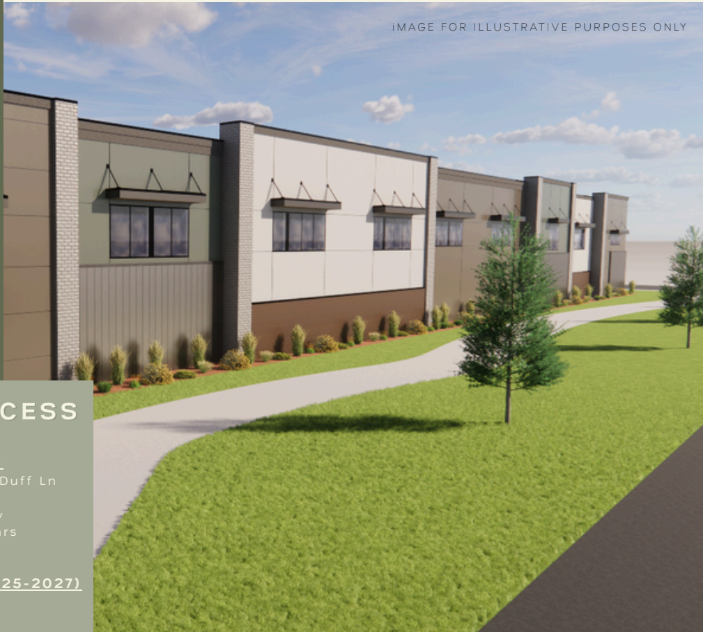
IMAGE FOR ILLUSTRATIVE PURPOSES ONLY