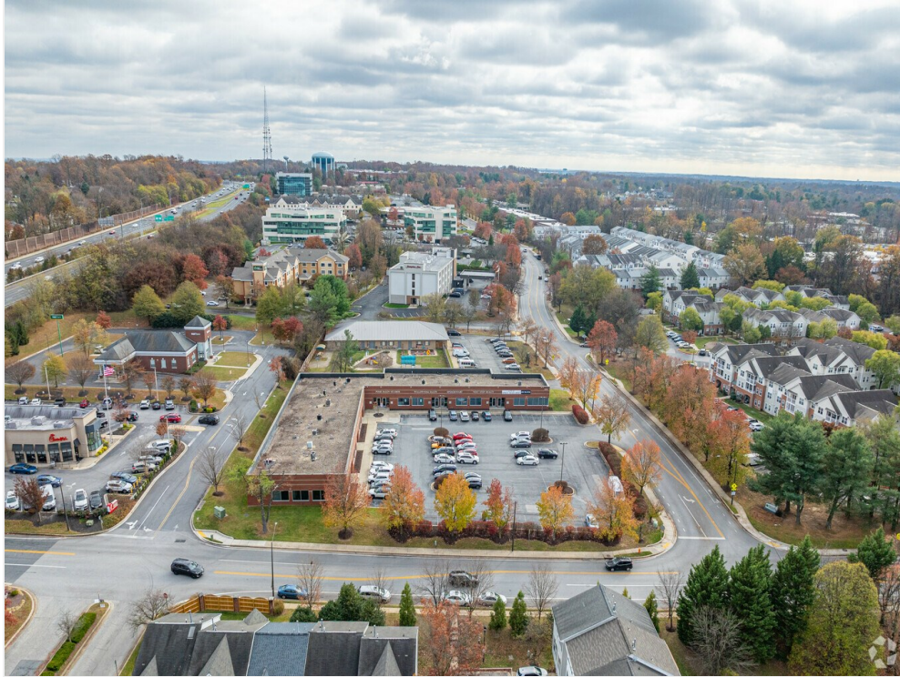
Aerial View of Building