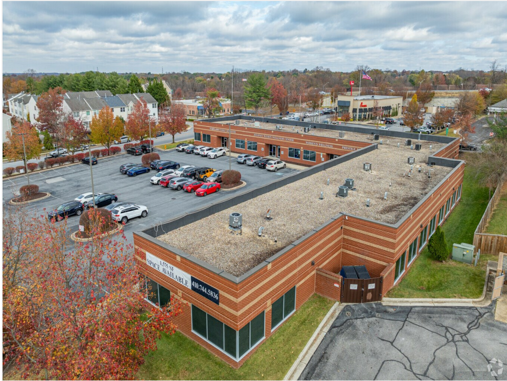
Aerial View of Building