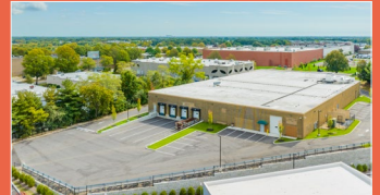
90 DAVIDS DRIVE Hauppauge, NY