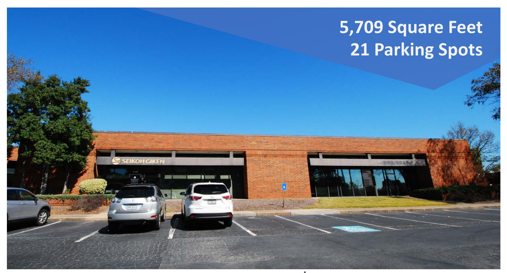
4405 International Boulevard, Suite B-112 | Norcross, Georgia 30093 Gwinnett Park – Northeast Atlanta